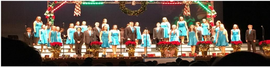
ALL THREE GROUPS AT THE CIVIC HOLIDAY SHOW ON DECEMBER 18TH

Welcome to issue #2 of the Alumni Newsletter! It seems as though everyone enjoyed the first one, and I am glad that everyone is excited to get updates on ETC!